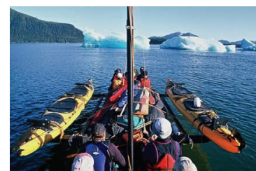
Spirit Dancer’s rack system with kayaks in place for outriggers.