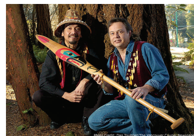
The Nahanee brothers make the paddles.