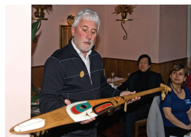
The second of 350 paddles to be made from trees from Stanley Park